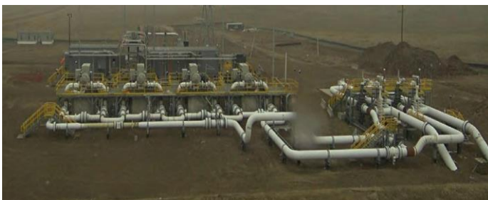
TYPICAL PUMP STATION ELEVATED